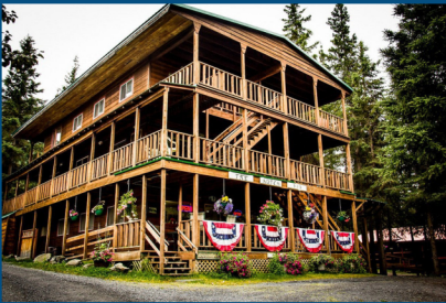
Free Staff Housing