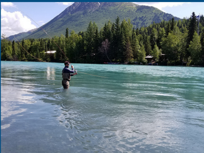
World Class Fishing