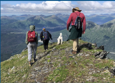
World Class Hiking